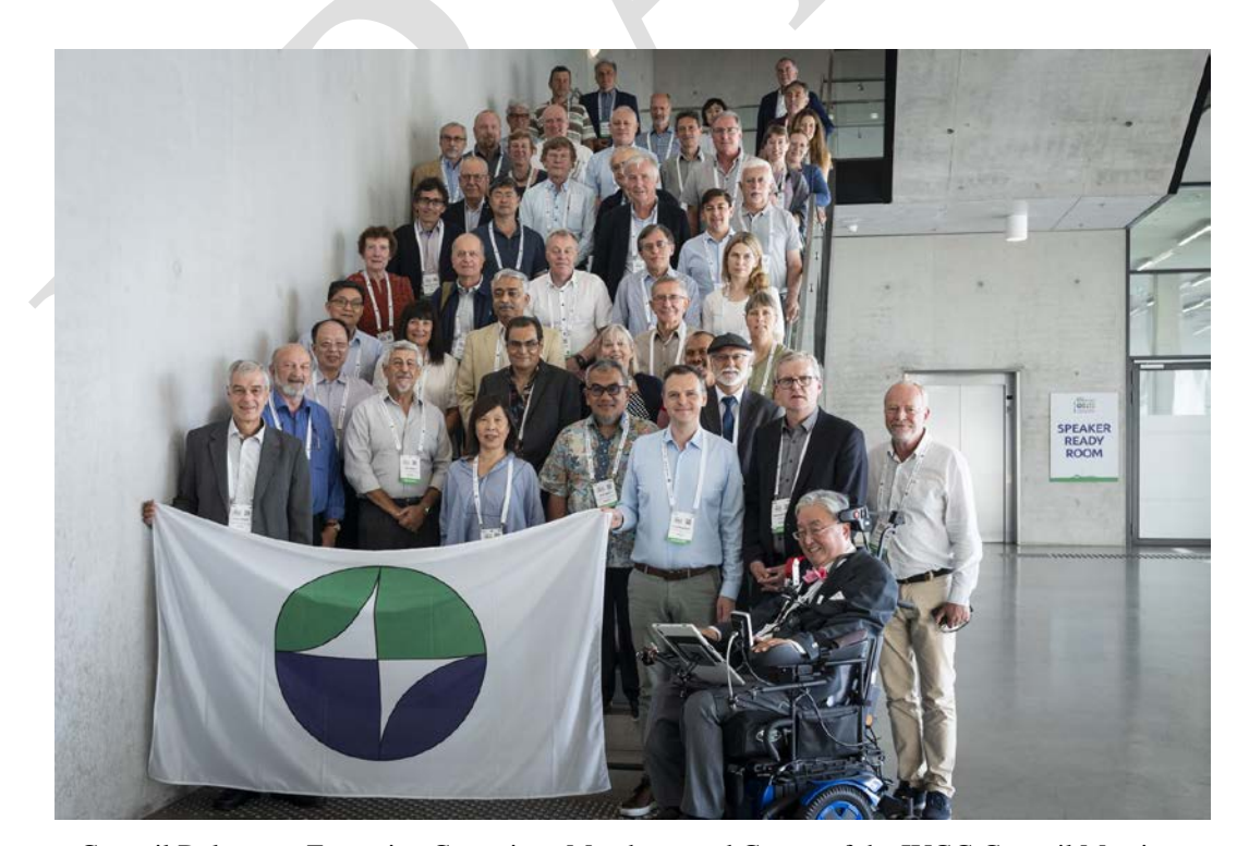
Council Delegates, Executive Committee Members, and Guests of the IUGG Council Meeting, 18 July 2023, Berlin, Germany